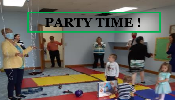
PARTY TIME !