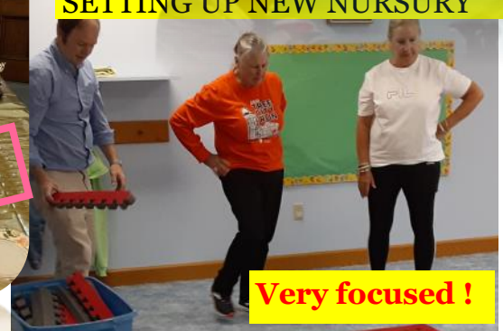
Very focused !