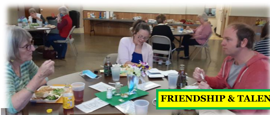
FRIENDSHIP & TALENT LUNCHEON