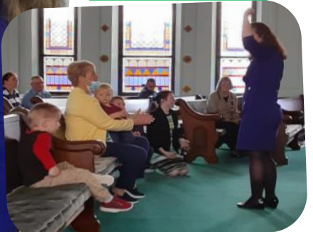
SETTING UP NEW NURSERY