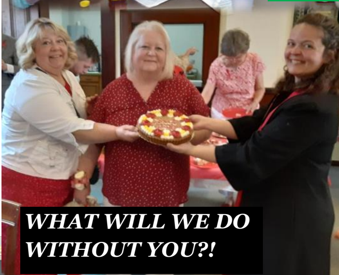
WHAT WILL WE DO WITHOUT YOU?!